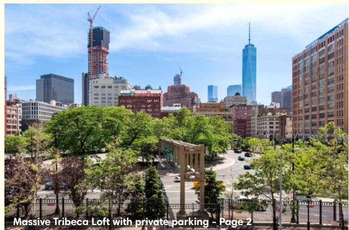
Massive Tribeca Loft with private parking - Page 2

“There have been more (asking) price reductions in the past three months than in the last two years collectively: Hyper luxoflation is being put into check. Unrealistic (asking) price escalations are not sustainable. Yet some properties are under-valued. Some enticing buying opportunities have emerged.”