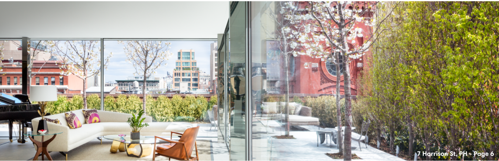
7 Harrison St, PH - Page 6