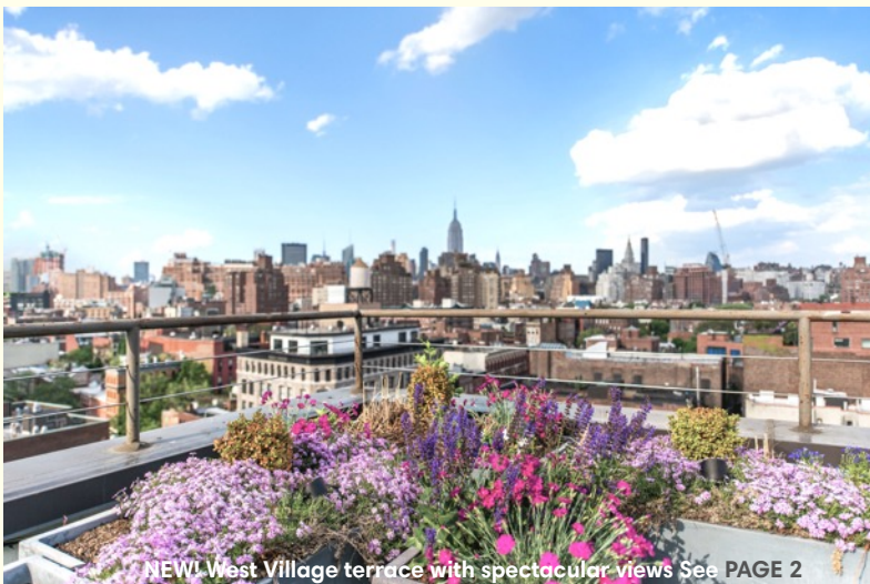
NEW! West Village terrace with spectacular views See PAGE 2

Is there a bubble in NYC? There is always a bubble, but in a major world center bubbles are much healthier, deflate less and in this city where most speculators are quite rich and can weather storms, bubbles are insulated.