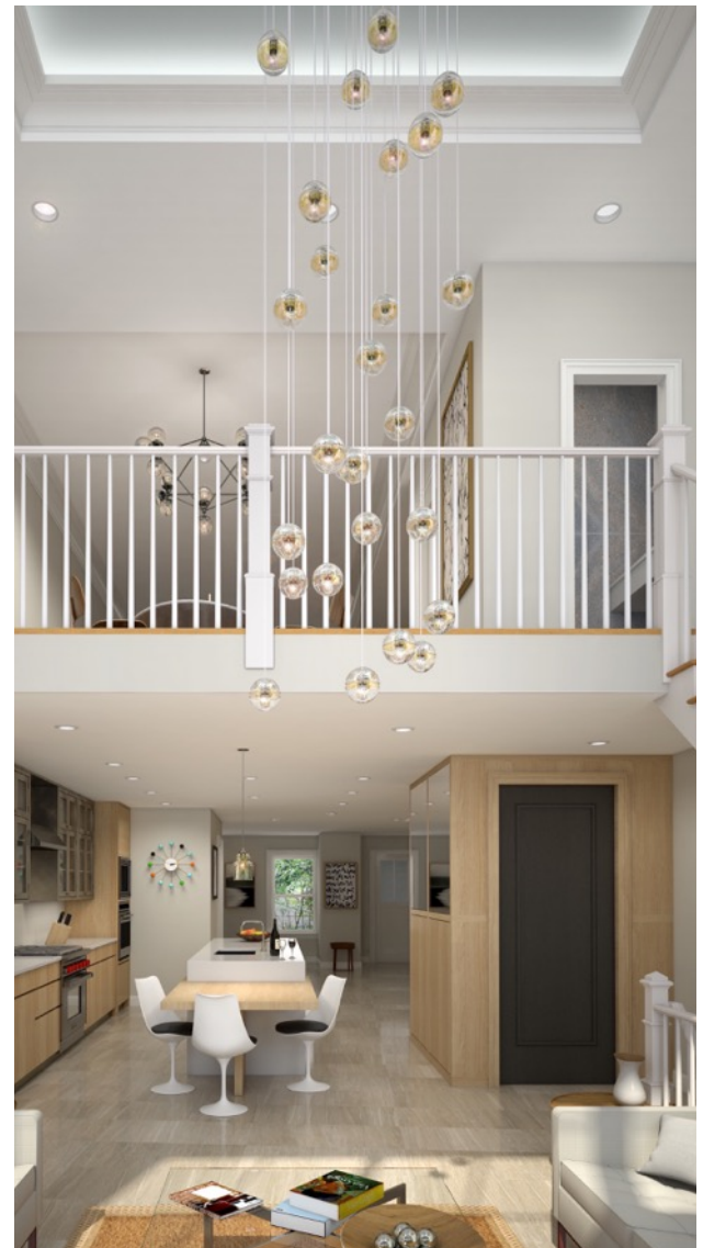
NEW! 152 WEST 13th ST - TOWNHOUSE ... see page 5

January could be termed a 'wait and see' market: the average high end client likes stability and certainty and right now it's impossible to feel either, yet those who are seeing the big picture are benefitting from some outstanding opportunities. While many regions are suffering enormous instability, the USA still looks like the world's bastion of stability, although the presidential election cycle is alarming and some political rhetoric aimed at the very wealthy could be a distractor. The GREAT news? Its almost certain interest rates will remain low for the foreseeable future: we know real estate markets love low interest rates. So while the Chinese investor buyer may have more difficulty getting money out of China, while the equity markets may remain volatile, there is a certainty that a large group of people that still need to buy, sell and rent. Leonard Steinberg www.THELEONARDSTEINBERGTEAM.com