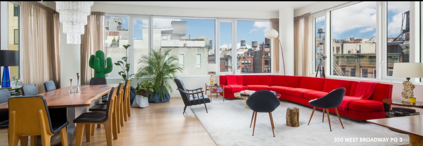
350 WEST BROADWAY PG 3