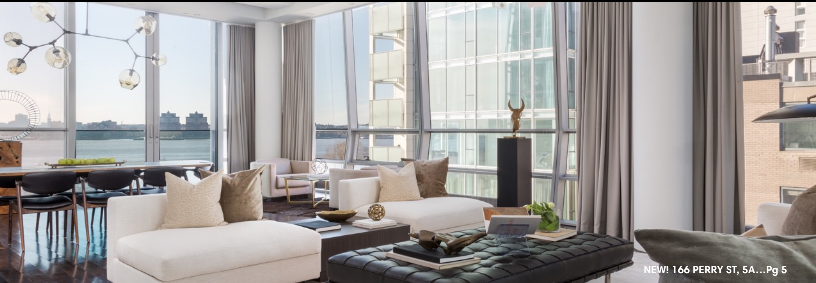
NEW! 166 PERRY ST, 5A...Pg 5