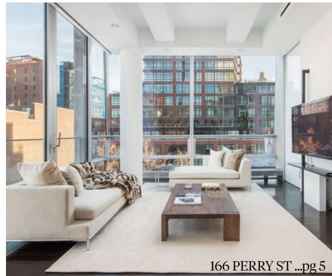
166 PERRY ST ...pg 5