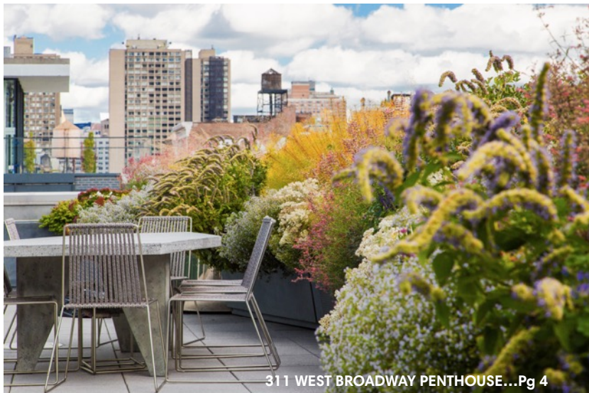
311 WEST BROADWAY PENTHOUSE...Pg 4