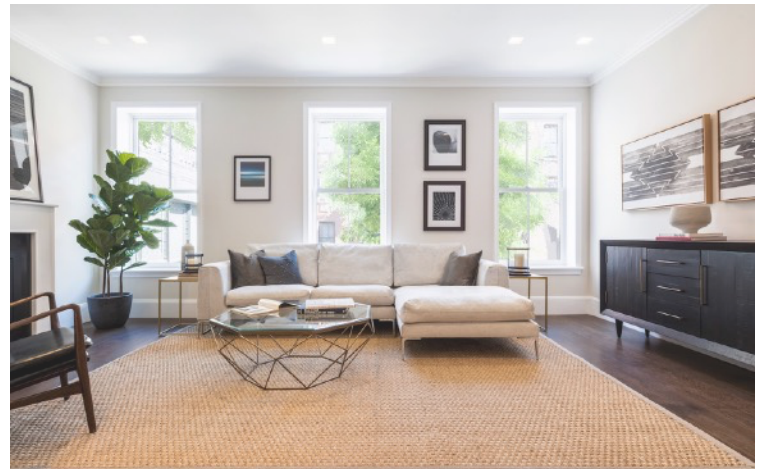
504 West 22nd Street, Chelsea $10,000,000

Located in arguably one of the most desirable parts of Downtown Manhattan on the charming treed streets of Gramercy, about 450ft from Gramercy Park, this mint 2-bedroom 2-bathroom home over 1,200 square feet in size, boasts northern and southern exposures and nearly 10ft-high ceilings, this home is bathed in light all day.