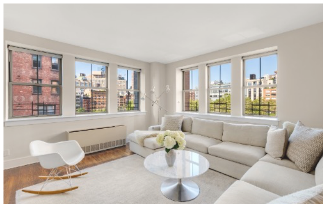
53 North Moore St, Tribeca $6,000,000 - 4,000+ 4-5 bedroom condo loft