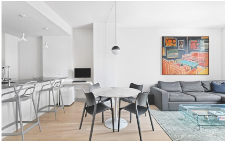
New! 160 East 22Nd Street, Gramercy $2,450,000 - NEW PRICE!

Rogers, Stirk, Harbour & Partners - architects of the Pompidou Museum, Paris, One Hyde Park, London, and One Monte Carlo, Monaco present their first residential building in the USA, perfectly perched on City Hall Park. Apartments range from 1- to 4—bedrooms and penthouses. 2021 Occupancy.