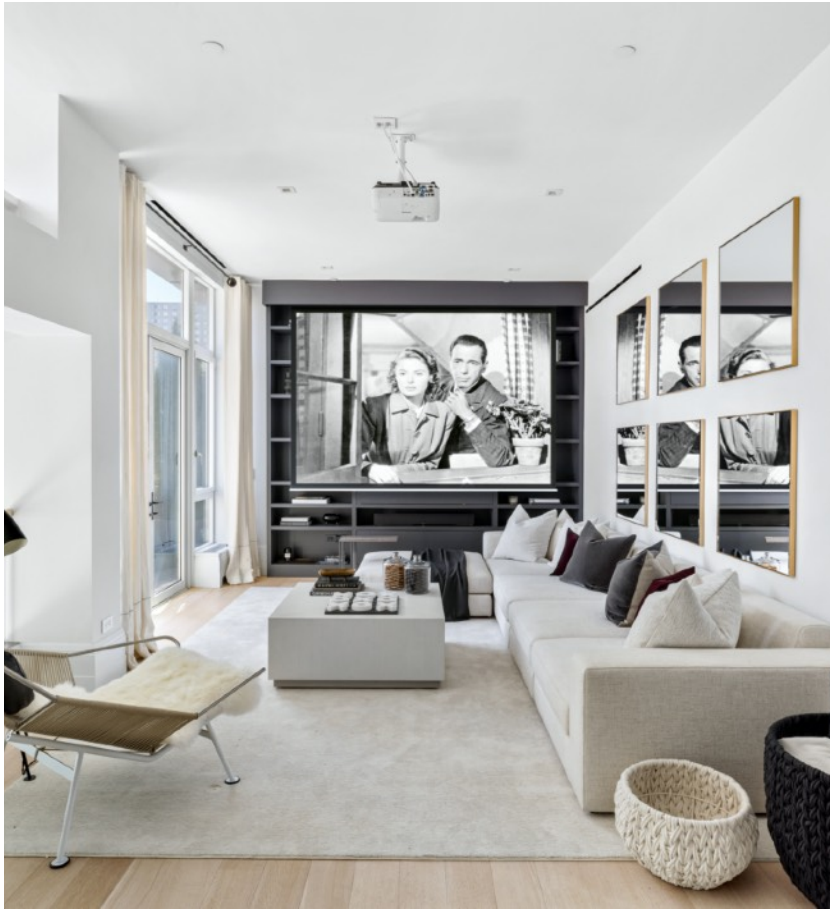
141 East 88Th Street. Upper East Side - Penthouse NEW PRICE! $8,9million

This bright, breathtaking 3-4 bedroom penthouse is one of only two newly constructed penthouses perched atop the recently converted full-service Philip House, boasting a rare combination of complete privacy and tranquility with FOUR landscaped terraces in total on both floors. All rooms face a terrace with views.