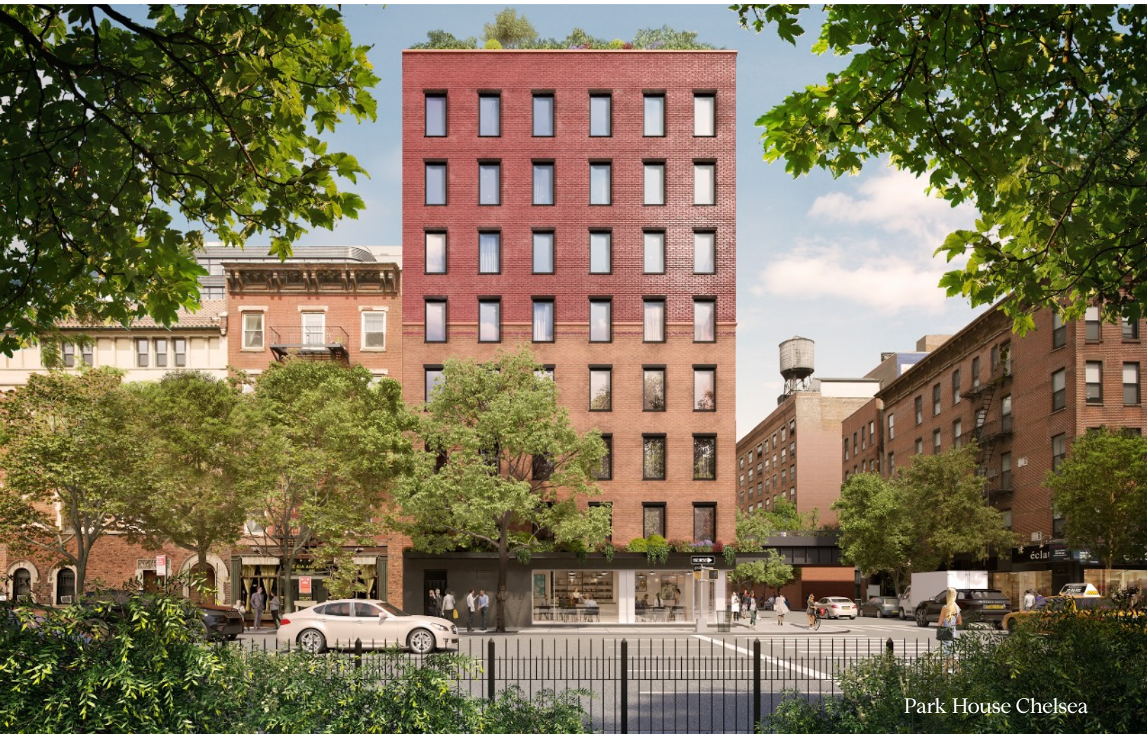
Park House Chelsea

As New York City begins to look more and more like NEW YORK CITY as each day passes, with the impact of mass vaccinations becoming visibly impactful, there is a new pool of buyers emerging in the city: the SUBURBAN buyer. 2020 was a year of the GREAT UNLOCKING, a time when trends, natural shifts and evolution resumed after several years of being in a 'semi-freeze-mode'. Baby-boomers whose kids were grown up and moved on to college had virtually no audience for their large suburban homes after the devastating SALT tax deduction limit of 2017. But 2020 changed all that. Those who left the city a decade-plus ago, are now returning, or buying a pied-a-terre in the city as well as other places. The one common theme I hear from all these buyers from new Jersey, Connecticut and Westchester? "We want the excitement and hustle and bustle of the CITY!"