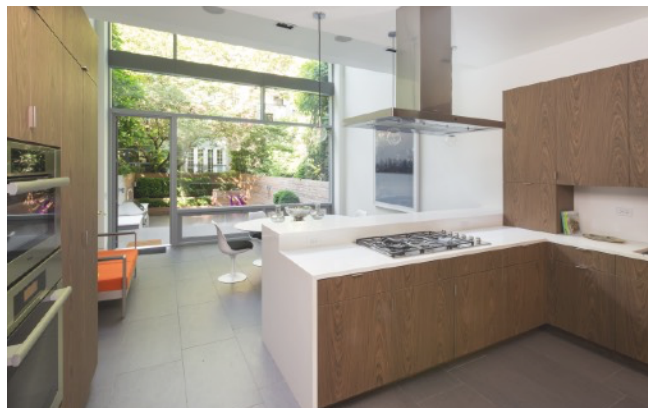
450 West 25Th Street, Chelsea - New! $35,000/month - 4-6 bedroom TOWNHOUSE RENTAL

Manhattan has averaged 300-plus signed contracts weekly since the start of 2021. Sales Volume is in record territory.