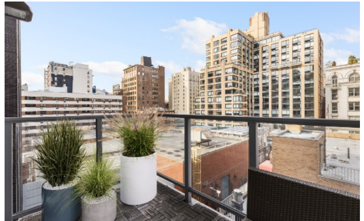
Winged 2-Bedroom Home with a Private Balcony

504 West 22nd St West Village $6,975,000