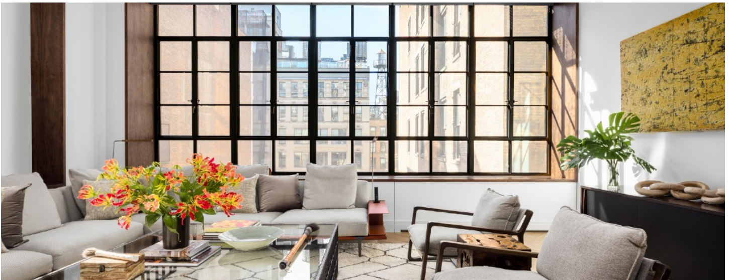
Triple Mint Full Floor Loft Moments From Madison Square Park

141 East 88th Street Upper East Side 3-4 bedrooms $8,500,000