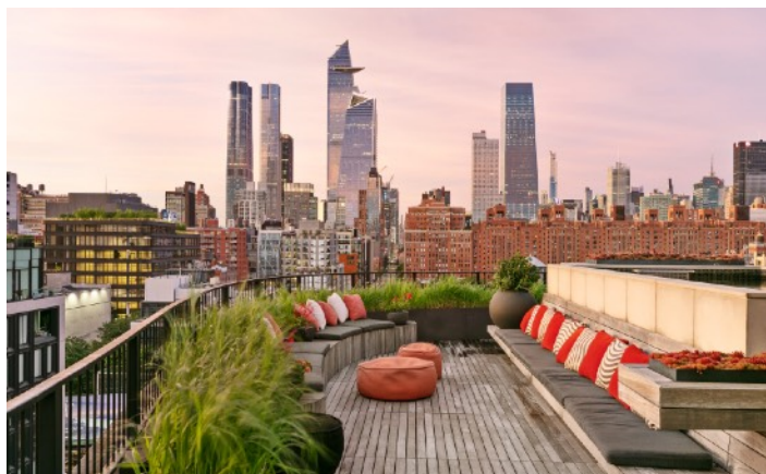
Published West Chelsea Penthouse with private rooftop Pool

832 Broadway Greenwich Village 3-4 bedrooms $5,000,000