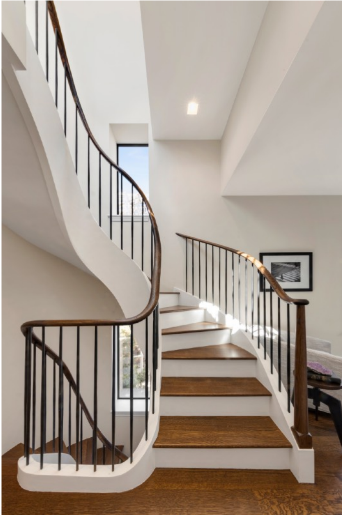
Townhouse Living with Super/Doorman Services

504 West 22nd St West Village $6,975,000