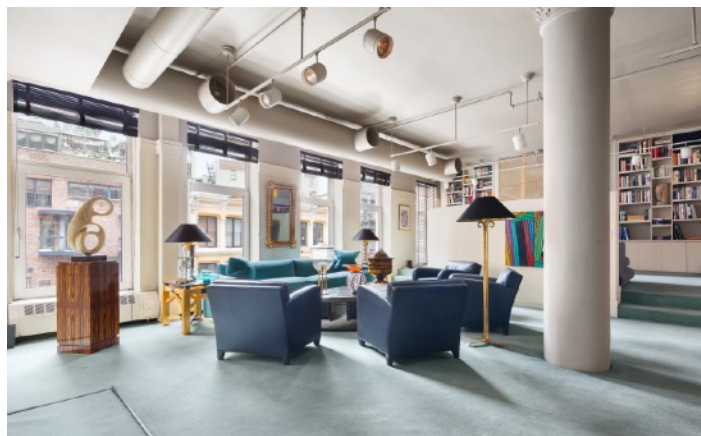
NEW PRICE! Grandly Scaled Pre-War Loft Awaits Your Touch

250 West Street TriBeCa 2-3 bedrooms $5,250,000