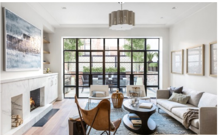
Gut Renovated Townhouse with Private Parking

520 West 19th Street West Chelsea Large 2-bedroom $3,500,000