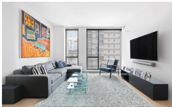
Pristine two bedroom in a boutique condo with a full suite of amenities

53 Downing Street West Village $15,700,000