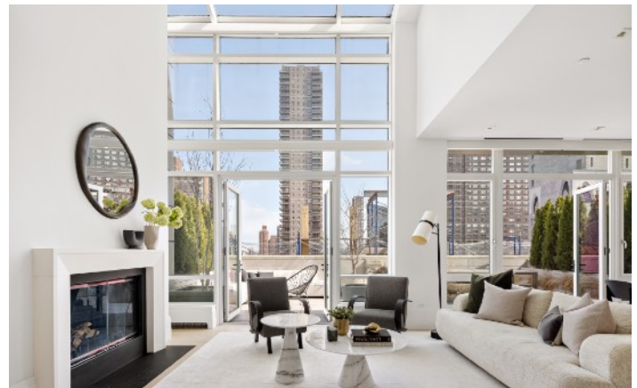
Pristine Penthouse with Four Private Terraces

165 West 18th Street Chelsea 2 Bedrooms $2,250,000