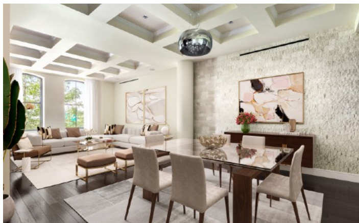
Pin Drop Quiet, River-front Tribeca Home with Soaring Ceilings

250 West Street TriBeCa 2-3 bedrooms $5,250,000