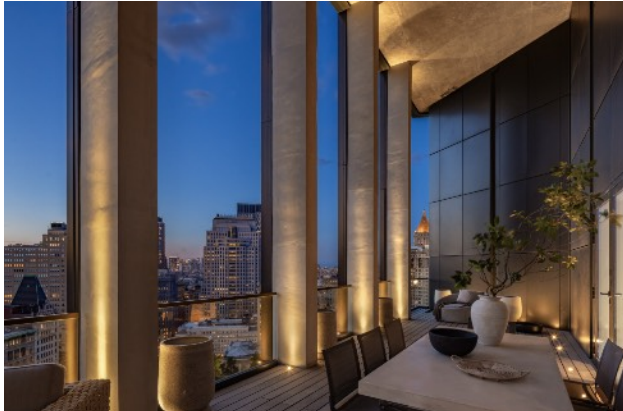
No. 33 Park Row, PH1 - 4 Beds, 4.5 Baths, $13,75M

The hideous New York sidewalk sheds that scar the streets of the city may see a new batch of designs aimed at improving the esthetics of these vulgar money-makers that stay up for far too long.