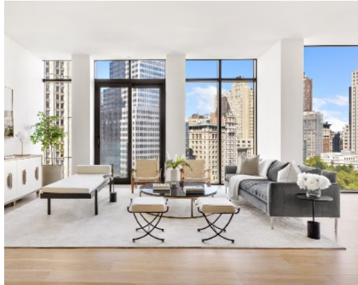
16A - 3 Beds, 3.5 Baths, $3.45M

Will Fifth Avenue be converted from a busy throughfare to a pedestrian zone? If so, where will all that traffic go? And will the lawless bikers of NYC be a priority over people and cars?